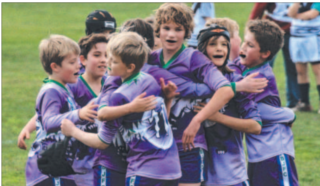
Some of the Brunswick Junior Football Club under-12s celebrate the club's first ever premiership last weekend.

"We only had one side in under-10s, and we've essentially taken that side through to